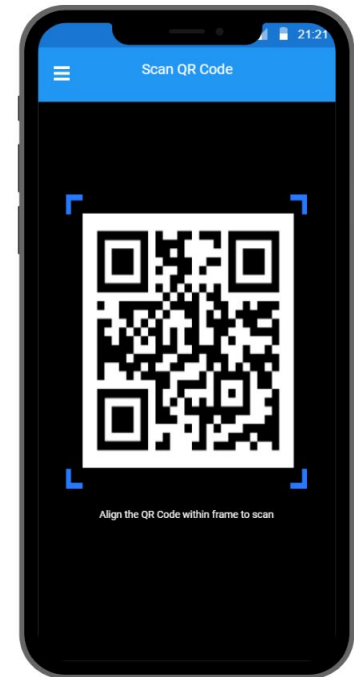
Figure 2. This page is the QR code to scan.

Many people may wonder why would I need an app that has healthy restaurants when I can search up healthy restaurants? As a result of this app, it would be easy to navigate and also there will be customer support. The customer support would be great with fast responses on the status of your order. This app will have GPS tracking location to help locate where your food is and the mode of transportation the person is taking. With this app there would be strict job hiring to make sure people understand how important and professional it is to make sure the customers get their food on time. This app will always